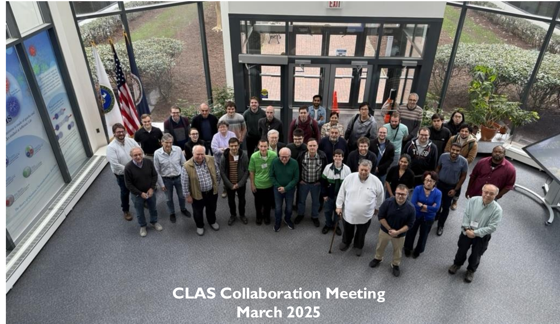
CLAS Collaboration Meeting March 2025