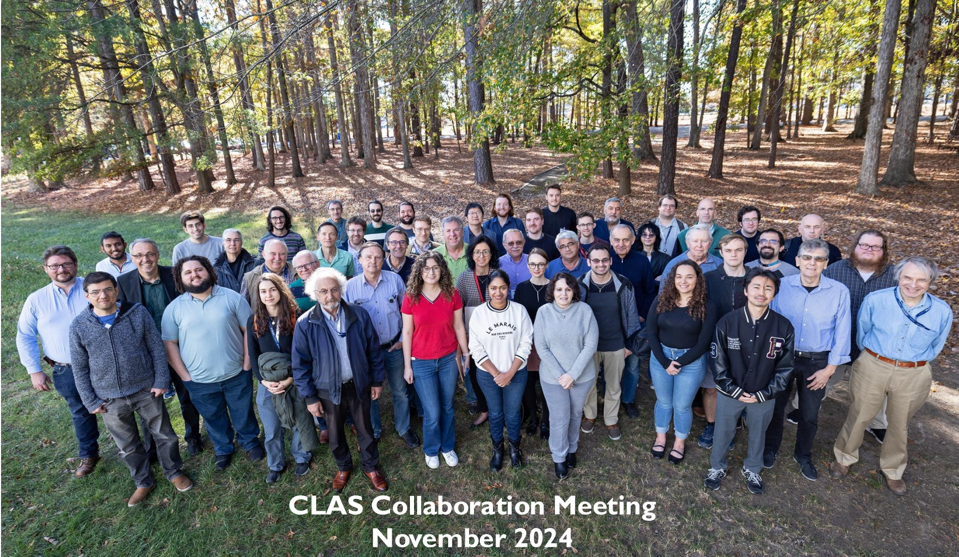
CLAS Collaboration Meeting November 2024