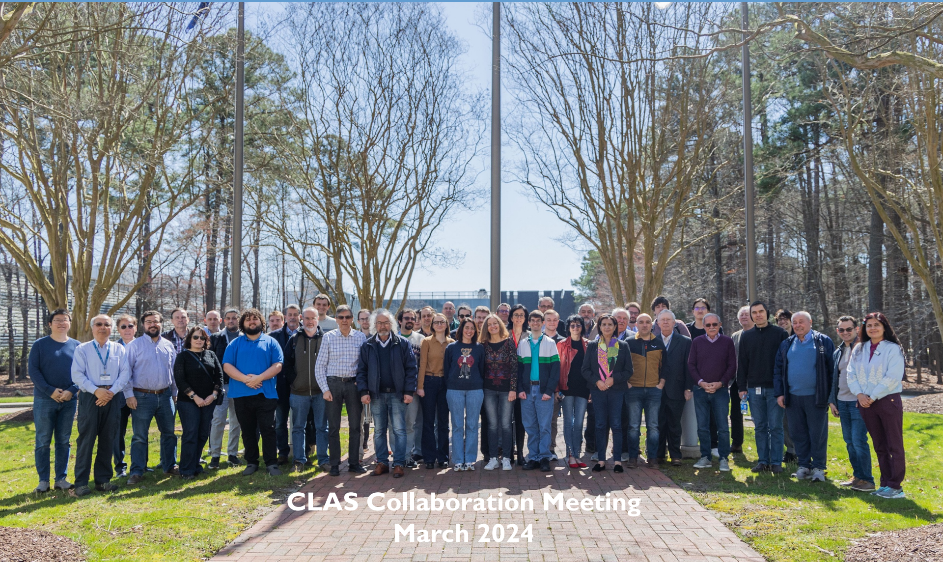
CLAS Collaboration Meeting March 2024