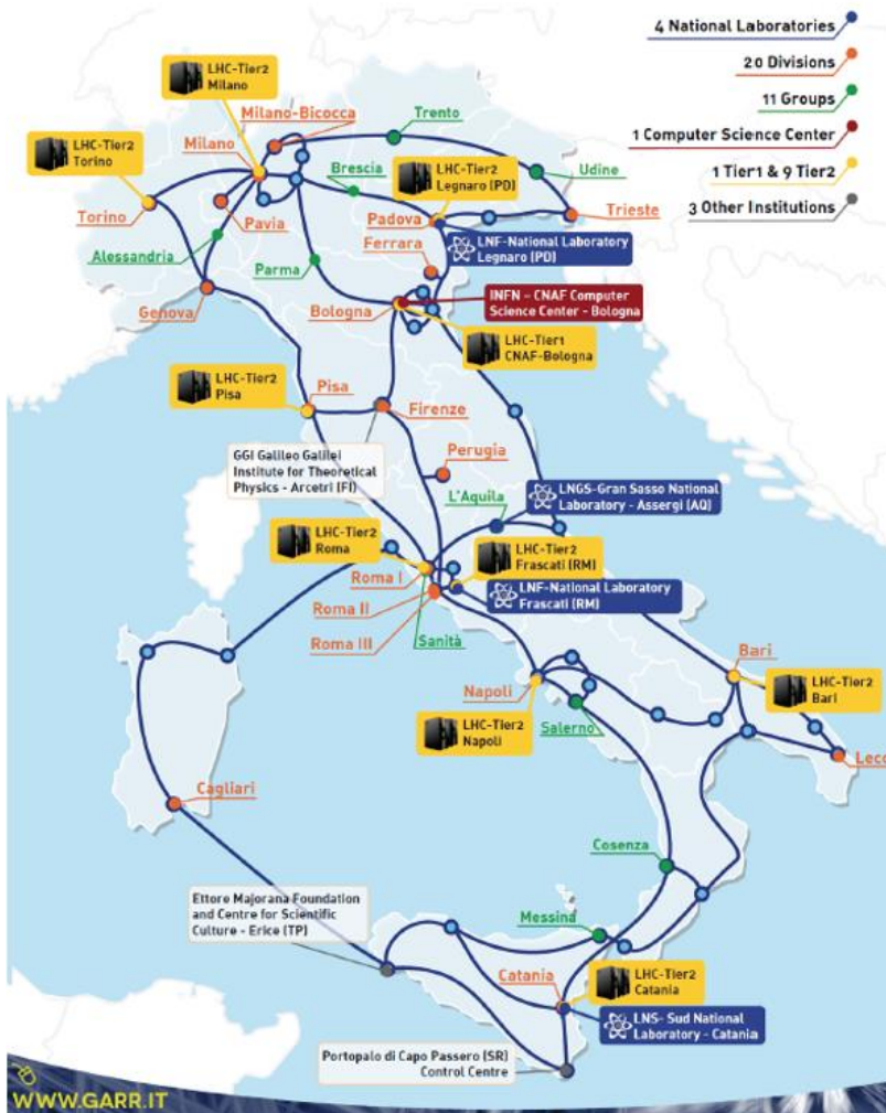
Fig. 1. Map of INFN facilities and LHC tiers.

The INFN Distributed Computing federation delivers the LHC experiments O(7-20)% of their computing budgets. It also supports several non LHC (e.g nuclear and astrophysics) experiments. The resources assigned to these communities are about 10-20% of the total.