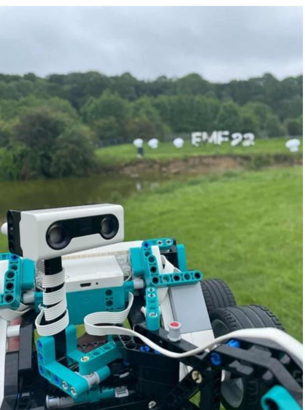
Percy, the Remote 3 Rover, at the Electromagnetic Field Festival

Remote 3 is now in its second year of challenges, with plans underway for the third, and continues to learn, develop, and build upon the remote experience gained over the COVID-19 lockdowns.