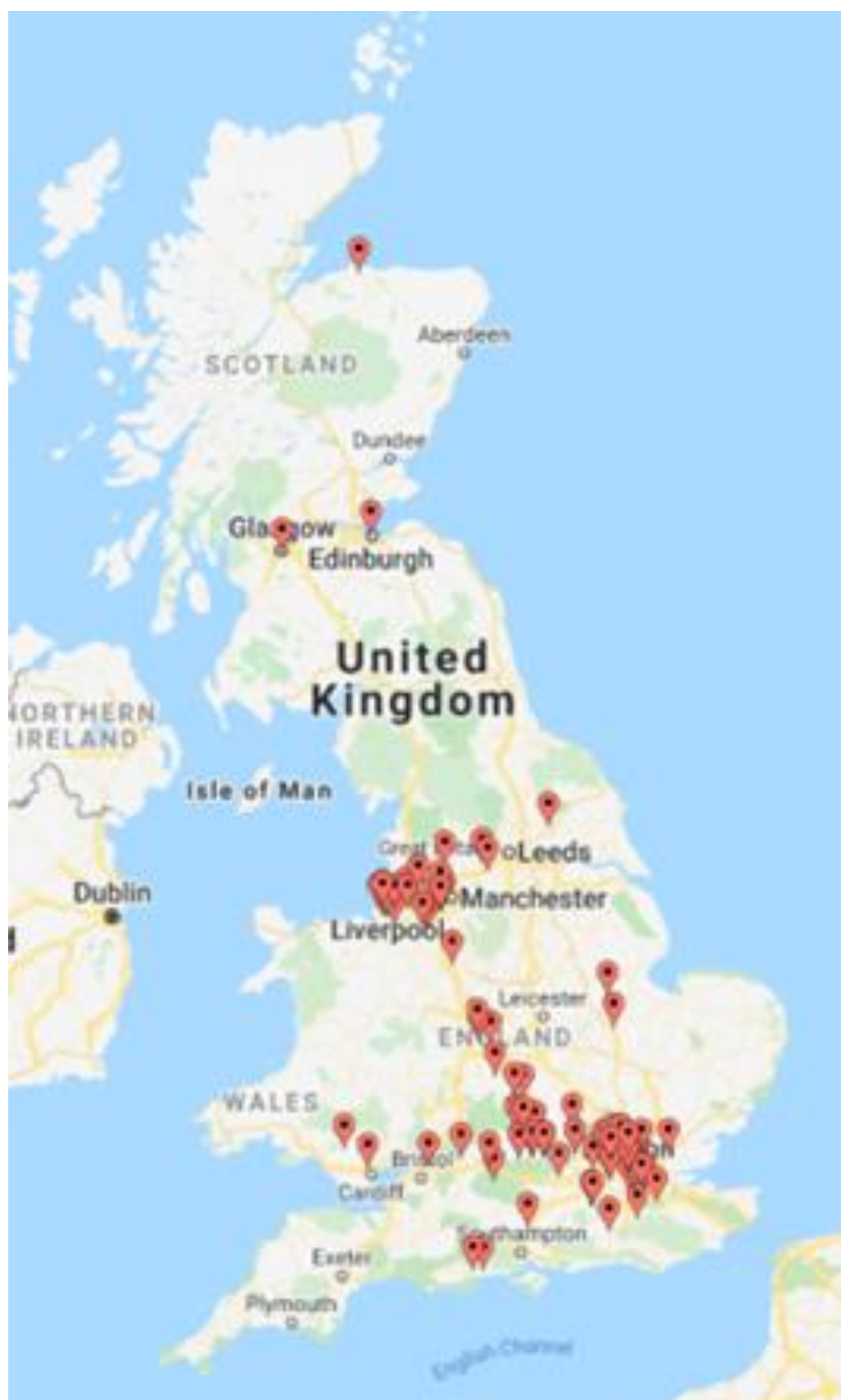
The schools with pupils who reached the 2021 Python Workshop

The remote workshop has continued to receive excellent feedback from attendees, and the 2023 workshop will be fully remote again. It is expected to reach an audience of ~100 students.