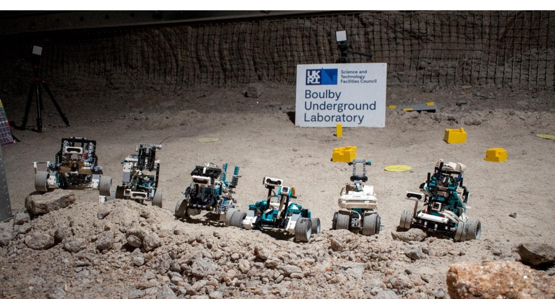
Several of the LEGO Mindstorms Rovers at STFC's Boulby Underground Laboratory