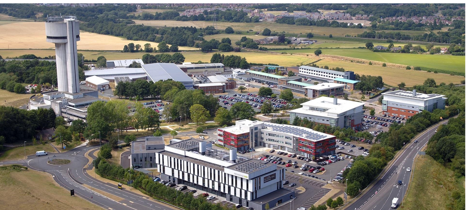
The two STFC sites with an SCD presence. Rutherford Appleton Laboratory (top) and Daresbury Laboratory (bottom).