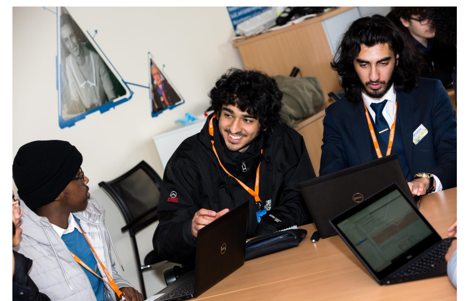
Participants at the Particle Physics Masterclass

In addition, the LHC Data workshop can now be made available to students after the actual masterclass, allowing students and teachers to continue to explore the data for themselves. This has led to a successful collaboration with the Institute for Research in Schools and the University of Oxford to create a research project for A-Level students, "Big Data: ATLAS".