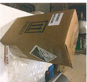
Gallium in 4G package