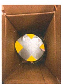
Target capsule in Silflex