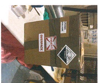
Final shipping package