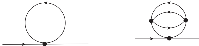
Simple tadpole and a generalized tadpole in \phi^4 model